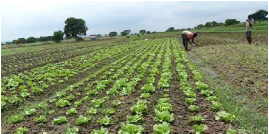
Figure 4 Small scale farming in western region

Western region farming continued to be the best survival ways through which the region has capitalized on for years and this has been a driver for community income generations in the region, many of which are small scale farmers. Farming input support is done by partners like African Parks (AP) through the individual CRBs to help the communities to farm and harvest produce that can be a source of income when sold. The image below shows the small-scale farms produce in the western region communities.