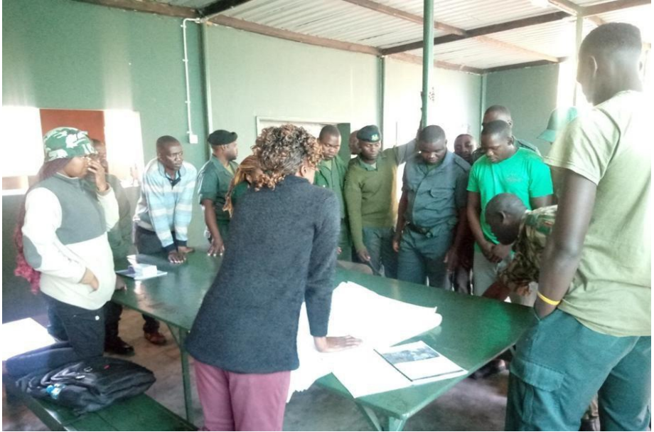
Figure 2 training session at Musa camp