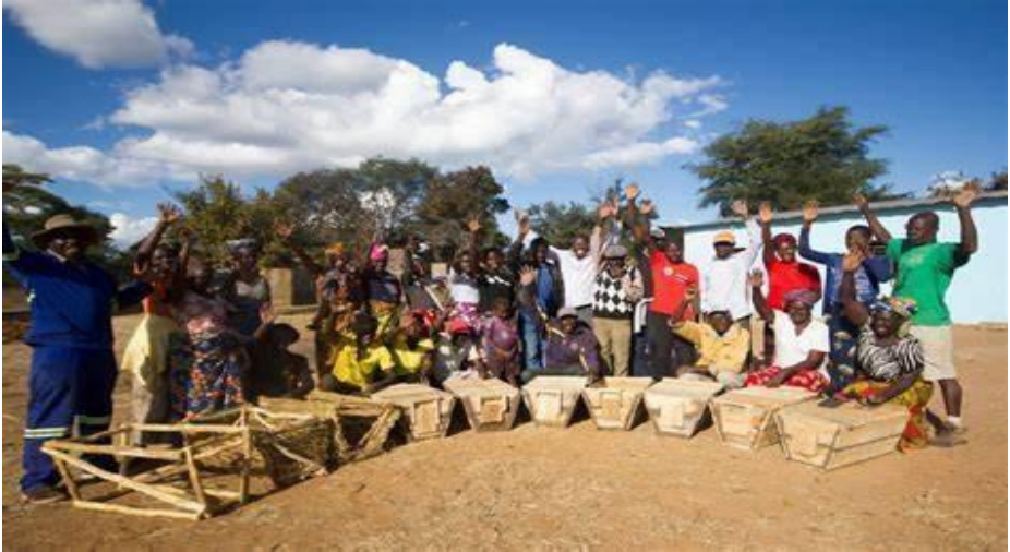
Figure 5 Community members involved in bee keeping

stakeholders and cooperating partners are coming on board to give relevant support to some communities with the setting up beehives and marketing the products with the objective of improving the livelihoods of the local community people in the region. The picture below shows the Beehives sample.