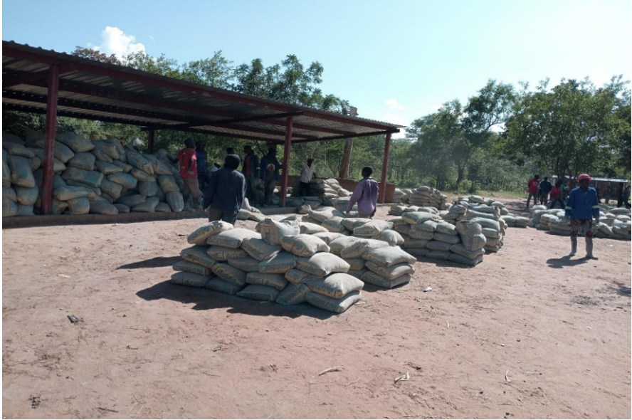
Figure 3 300 Pockets of Cement