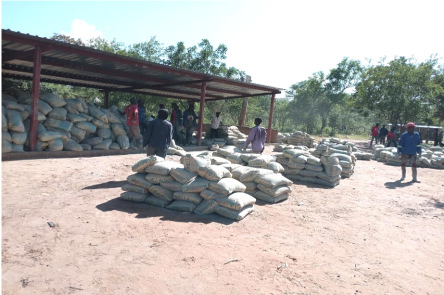
Figure 4 352Bags fertilizer