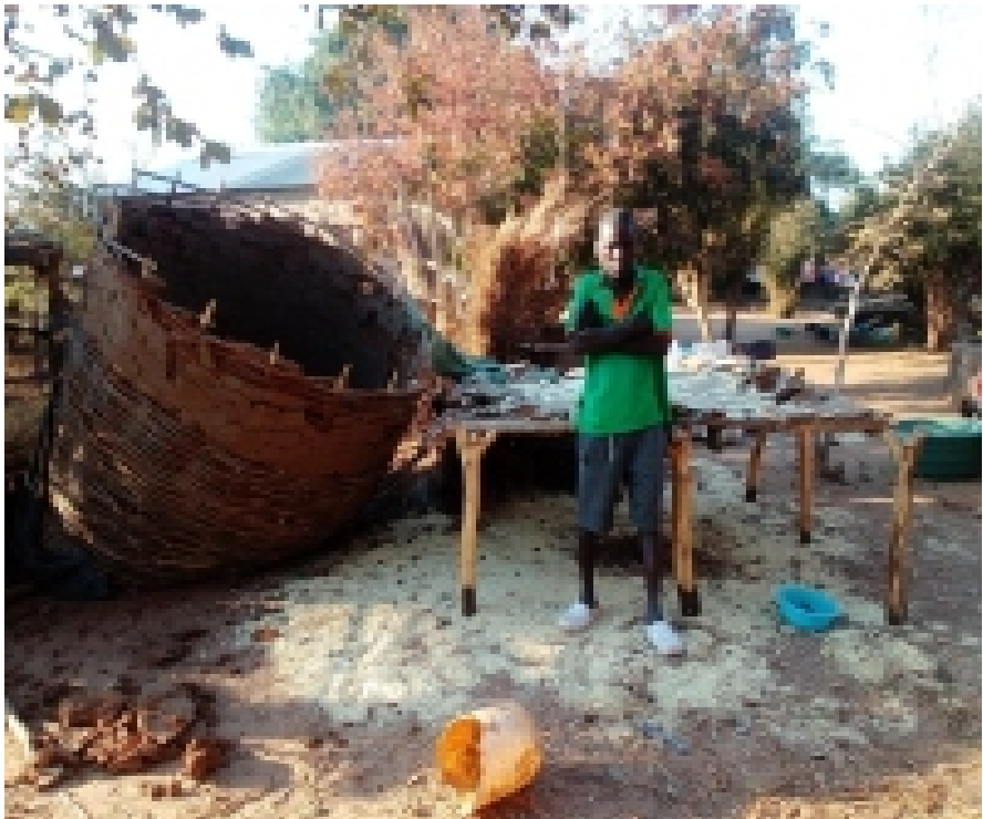
Figure 5 Human Wildlife Conflict