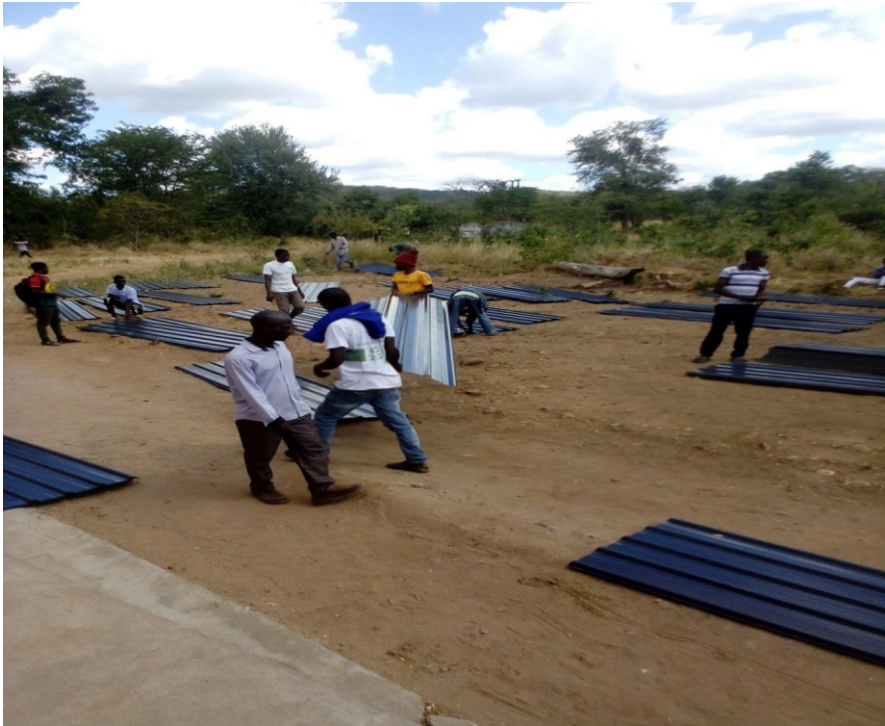
Figure 2 communities benefited from carbon credits funds